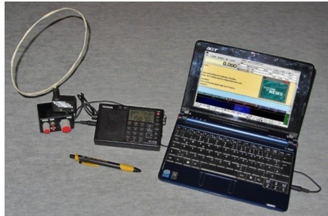
All the equipment needed to receive VOA Radiogram. (The mini-loop antenna can be replaced by a random wire or even the built-in whip.)

You can receive VOA Radiogram on any shortwave radio, even an inexpensive portable with no SSB capability. Patch the audio from the radio to a computer. If you don't have a patch cord, place the radio's speaker near the built-in mic of a laptop PC.